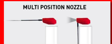
MULTI POSITION NOZZLE