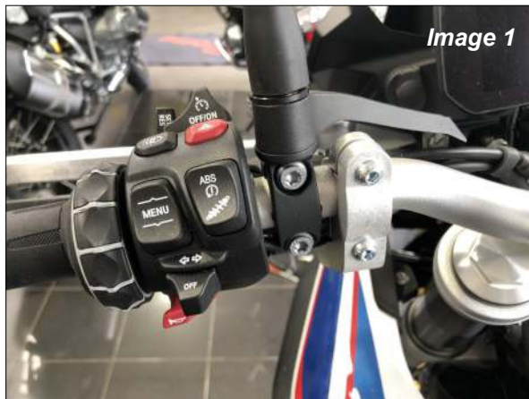
← Clamp location on handlebar